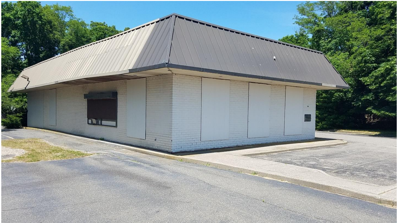
2,730 SF Building with Drive Thru and Full Basement 8' Finished